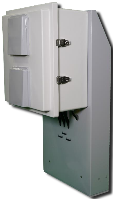
Neatly Conceals Hoses & Wires